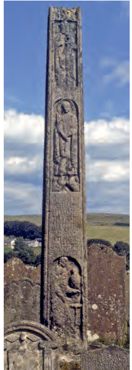
Figure 1. Shaft of a stone cross at Bewcastle, Cumbria.

The functions of Anglo-Saxon crosses as field monuments were various, as foci for prayer and devotion, and indeed for theo-